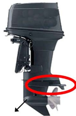
Area we are looking at, but from a top view.

Measure the total width of the fin. 'C' = mm